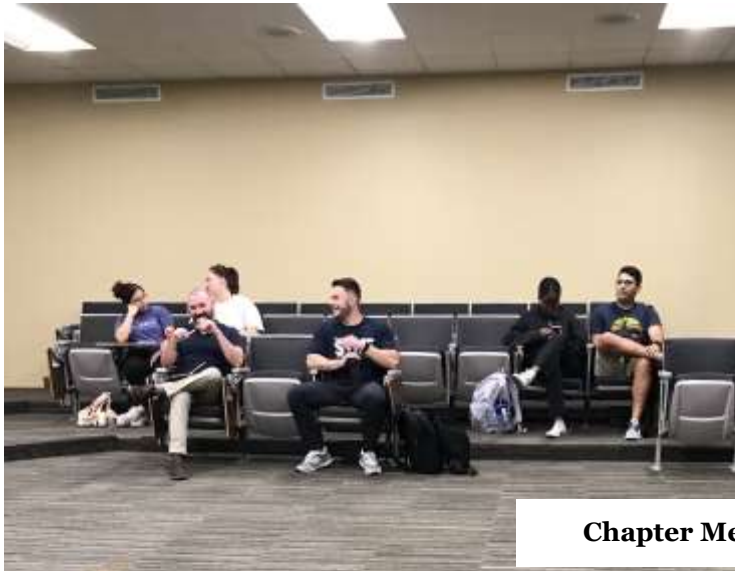
Chapter Meeting Participants