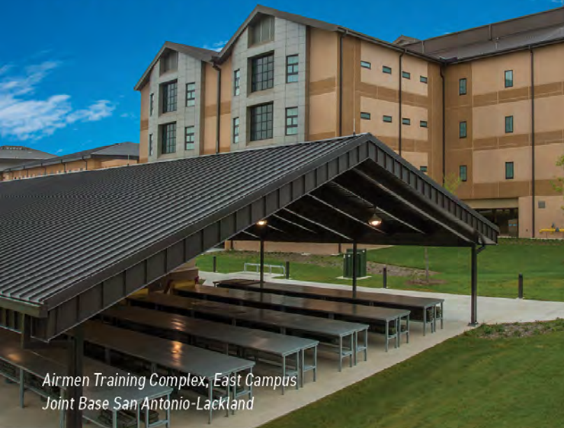
Airmen Training Complex, East Campus Joint Base San Antonio-Lackland

PROUDLY SUPPORTING FEDERAL CLIENTS FOR 30 YEARS.