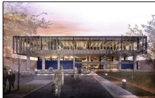
Cyber Innovation Center