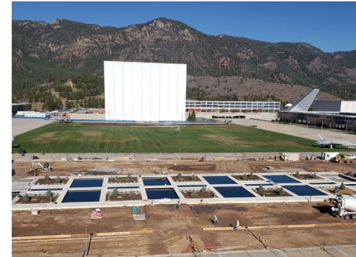
Repair Air Gardens