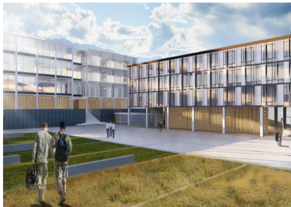
Prep School Dormitory