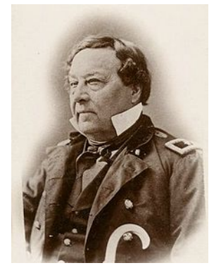
Benjamin Louis Eulalie de Bonneville