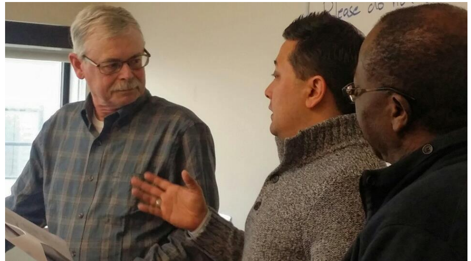
Attorney talks to businesses after a training on construction legal considerations.