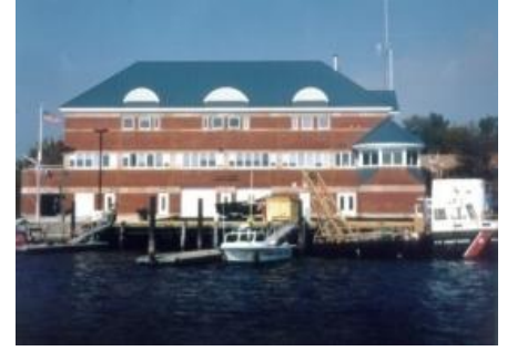
Sectors & Stations