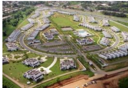
Housing & Barracks