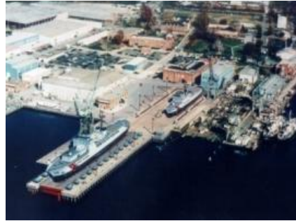
Industrial Facilities, Bases & Moorings