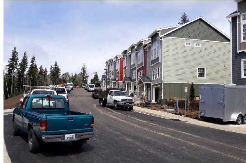
New Family Housing, Astoria OR