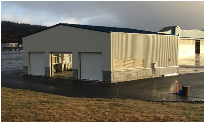
Liquid Oxygen Facility, Kodiak AK