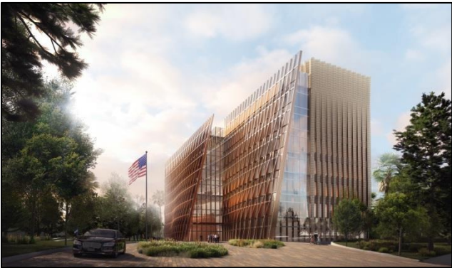
SHoP Architects U.S. Embassy Tegucigalpa