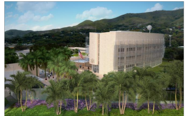
Krueck + Sexton Architects U.S. Embassy Port Moresby