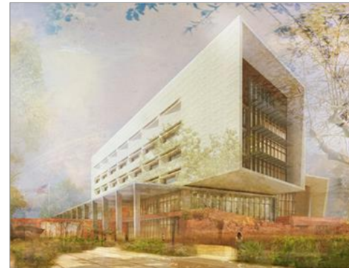
Zimmer Gunsul Frasca U.S. Embassy Asuncion