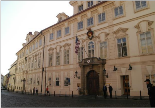
Beyer Blinder Belle Architects U.S. Embassy Prague Renovation