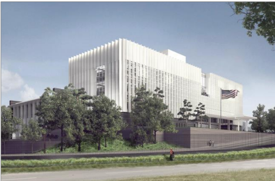
Miller Hull Partnership U.S. Embassy Guatemala City