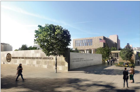
Ennead Architects U.S. Embassy Ankara