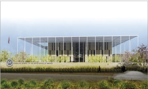
Richard + Bauer Architecture U.S. Consulate General Matamoros