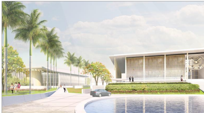
Weiss/Manfredi Architects U.S. Embassy New Delhi