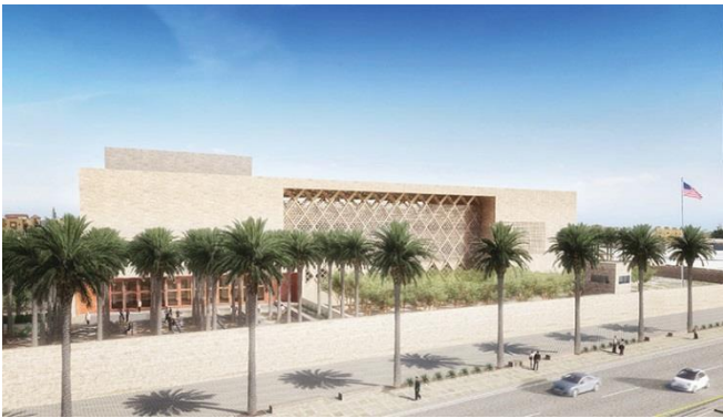
Skidmore Owings & Merrill U.S. Consulate General Dhahran