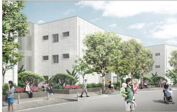
BNIM Architects Staff Housing Hong Kong