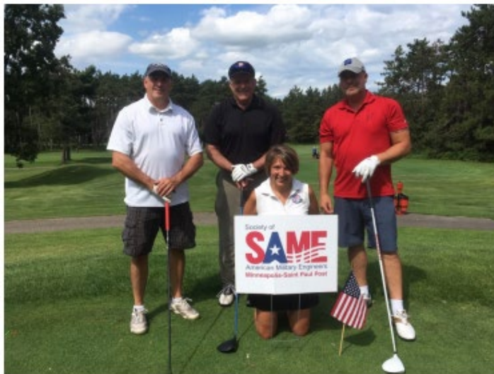
MSP Post members showing support for MMFF at the annual MMFF Golf Event

>$18,000: Amount of donations that have gone directly to military families