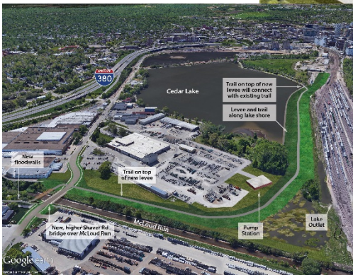
Cedar Rapids Flood Risk Management – Cedar Rapids, IA