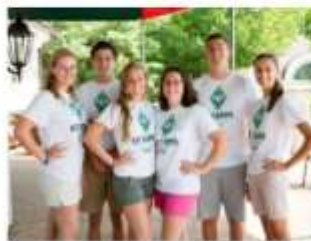
Camp Counselor Qualities

As a Camp Counselor , you will be an active participant in all camp activities and will assist your Camp Director with a variety of daily tasks, all with the goal of creating a memorable and meaningful camp experience for your campers. Our Counselors interact with our campers throughout the entire day, helping them make friends, try new things, and generally caring for their well-being. The role of a Counselor is to participate, build relationships and have fun while ensuring the physical and emotional safety of every child.