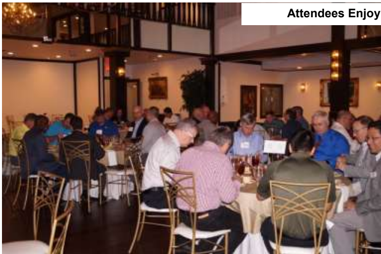
Attendees Enjoy Networking Time