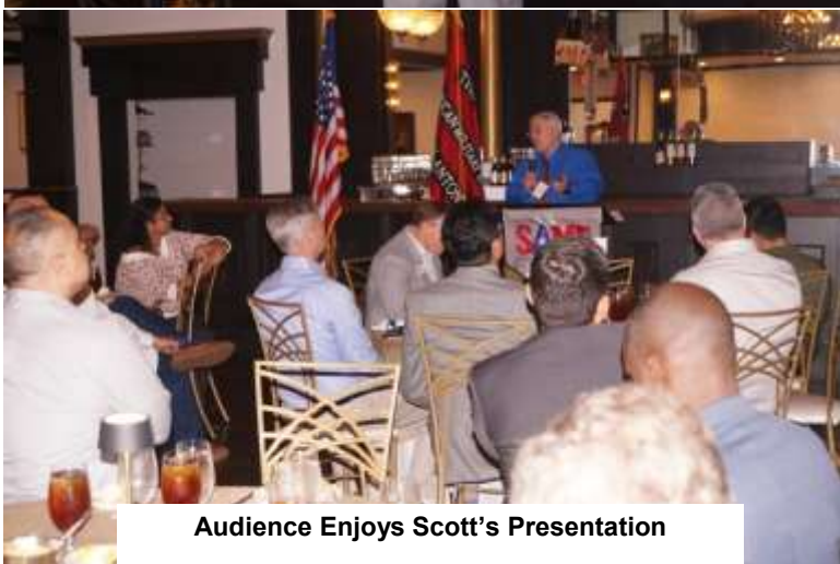
Audience Enjoys Scott's Presentation