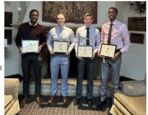
Texas Tech Winners