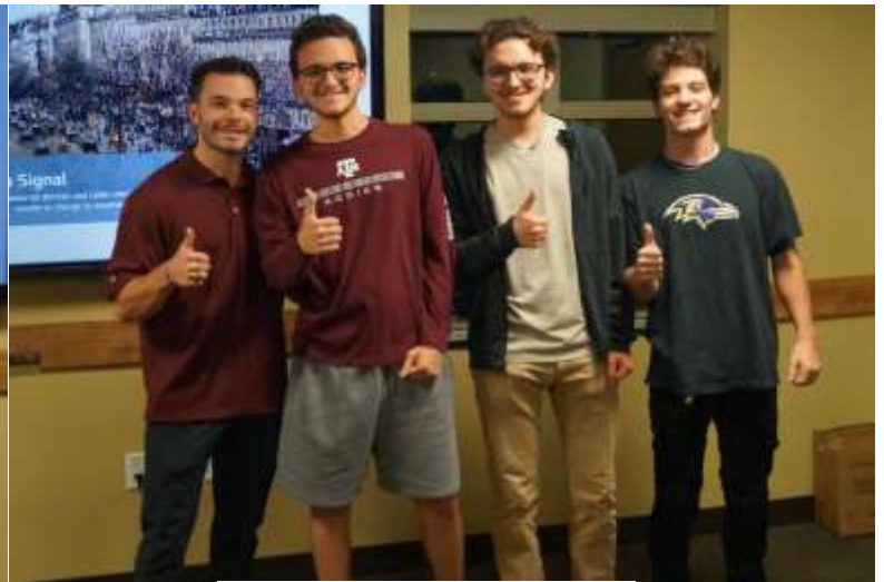
Installation of Chapter