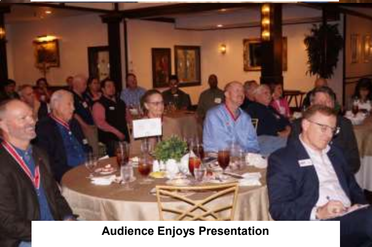
Audience Enjoys Presentation