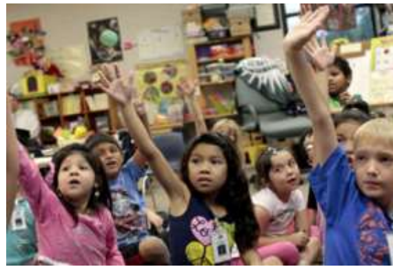
Local Kindergarten Class