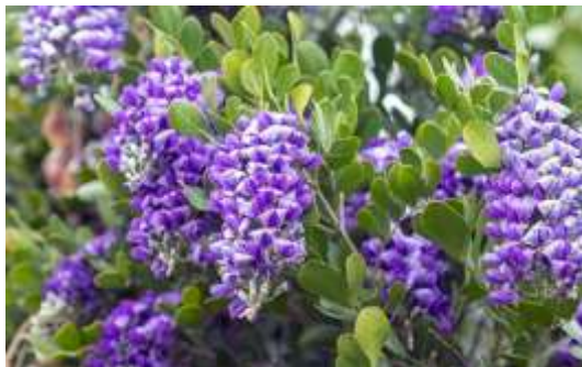
Texas Mountain Laurel