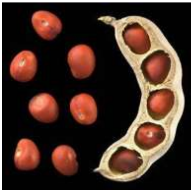
Mountain Laurel Seed Pod