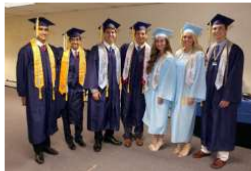
John Jay Graduating Class