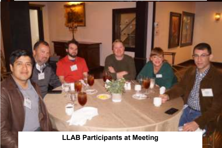
LLAB Participants at Meeting