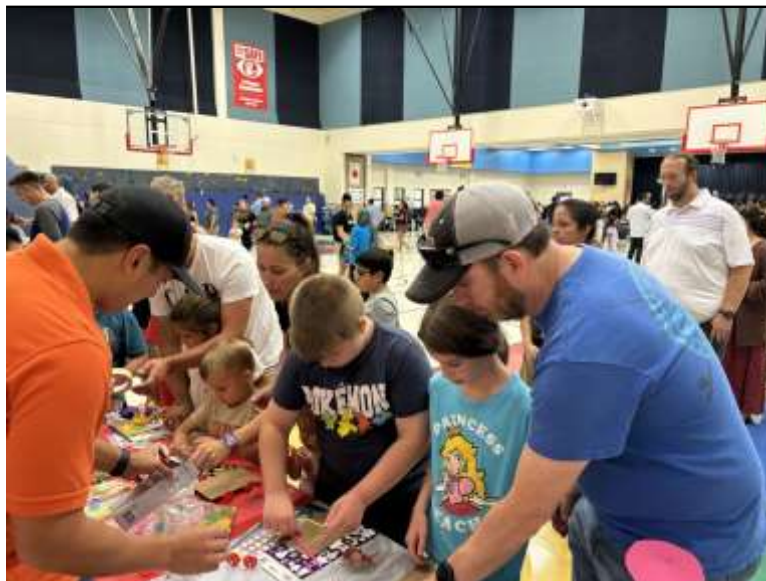
Race Car Building at Event's Post Exhibit