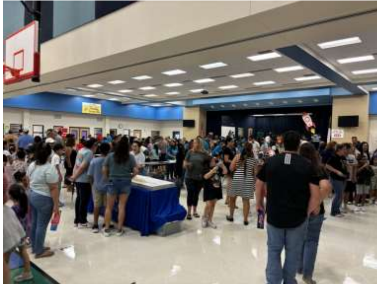
Attendance at Fields Elementary STEM Night

Prior to the STEM Night Harold also participated in the National STEM Challenge which included virtual judging of student projects.