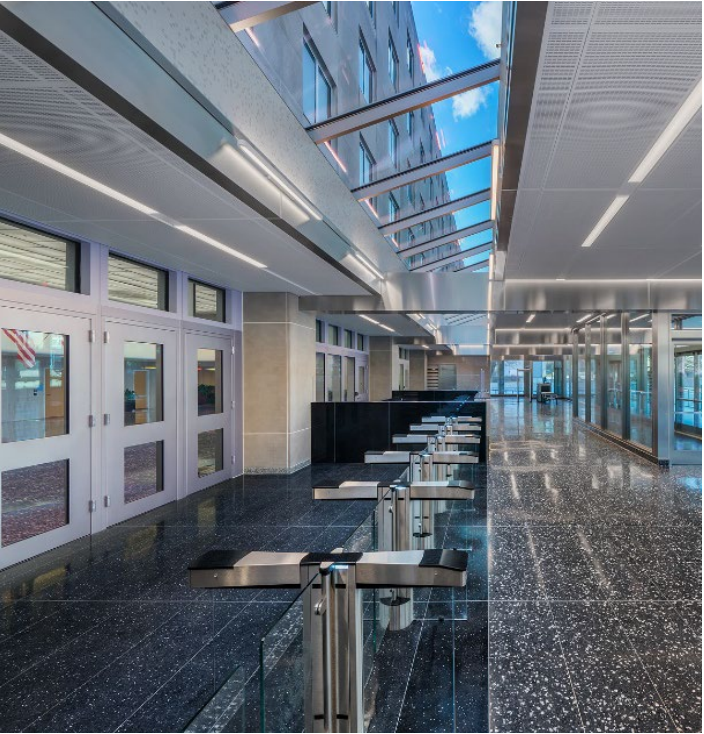
▲ Security / access control