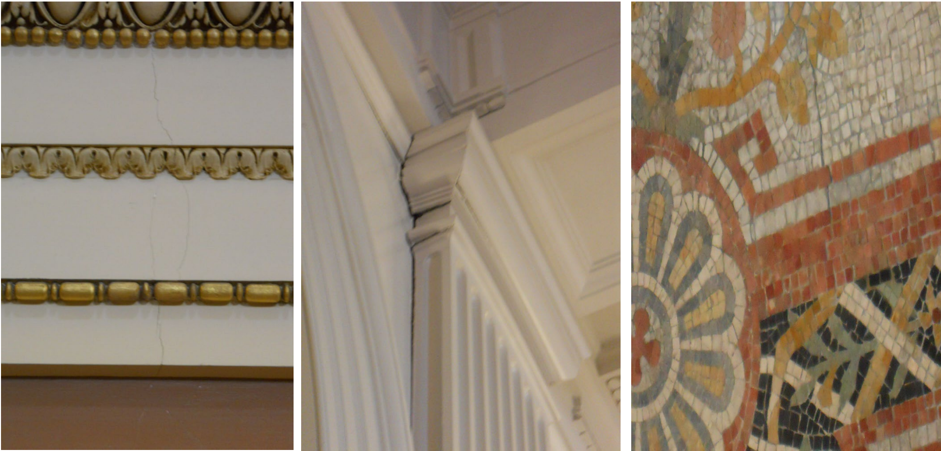
▲ Response to the August 2011 earthquake in Washington, DC for the Architect of the Capitol

Employees with active Safety Assessment Program (SAP) certifications