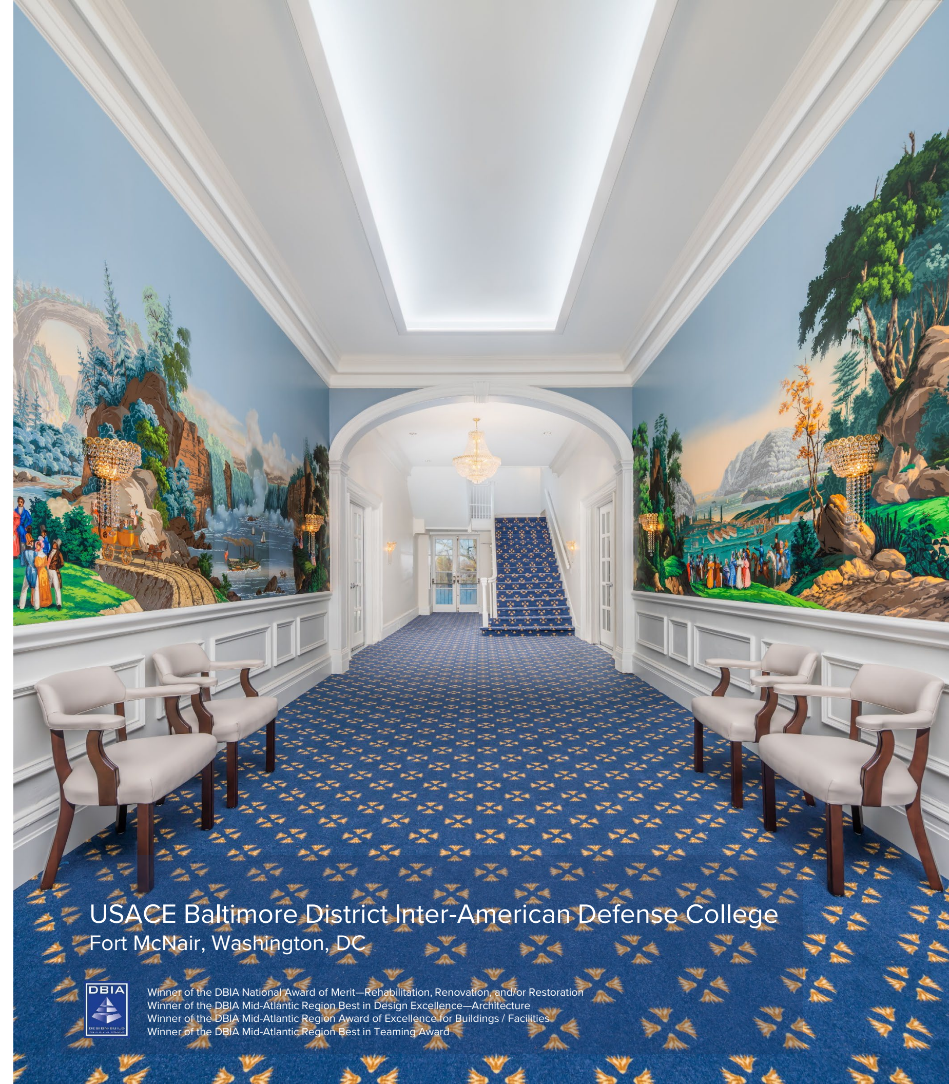
USACE Baltimore District Inter-American Defense College Fort McNair, Washington, DC