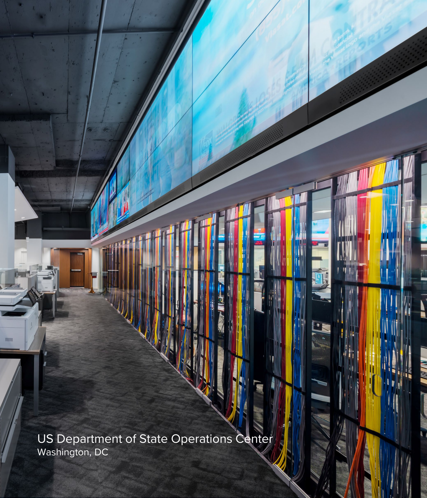
US Department of State Operations Center Washington, DC

We are design leaders in flexible, scalable, high-performance spaces with specialized security and regional considerations around the world.