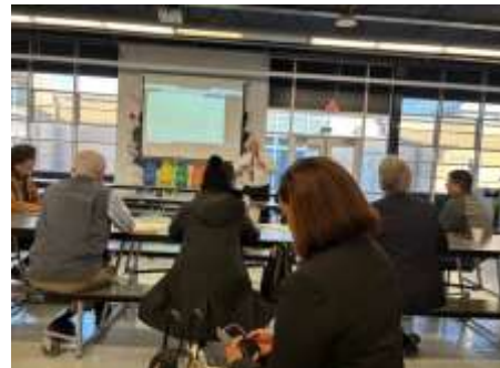
Judges Orientation Briefing

The volunteer organizer for the event indicated there were 86 volunteers that judged at the event.