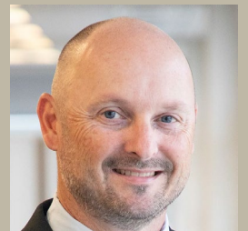
WILL HARLON ENVIRONMENTAL