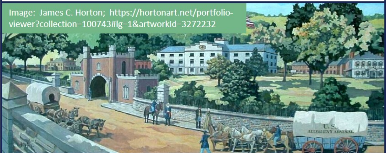
Image: James C. Horton; https://hortonart.net/portfolio-viewer?collection=100743#lg=1&artworkId=3272232