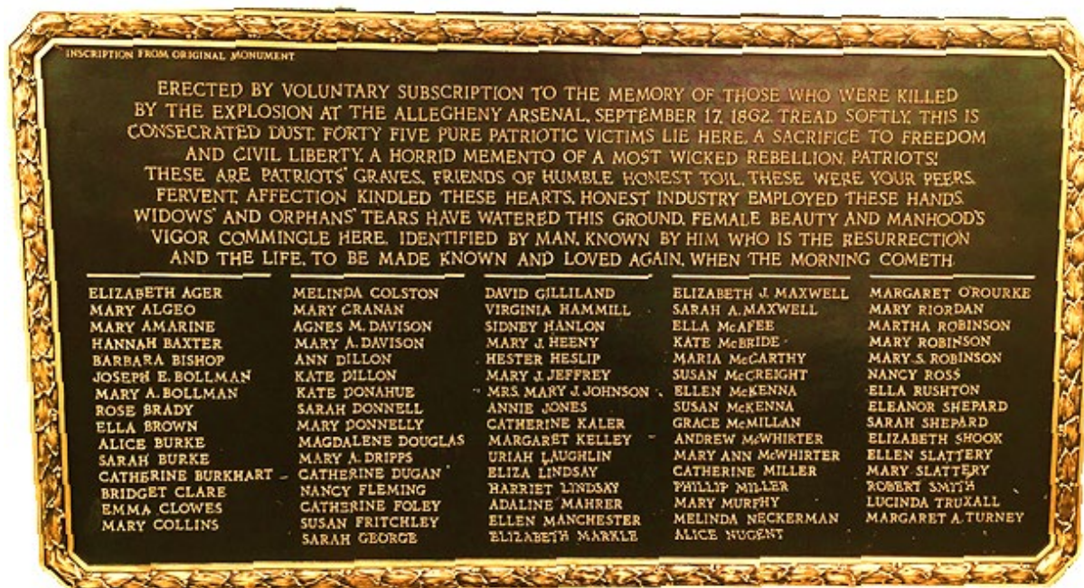
Memorial Plaque at Allegheny Cemetery, Section 17/18 in Lawrenceville, PA for the Arsenal Workers Who Lost Their Lives