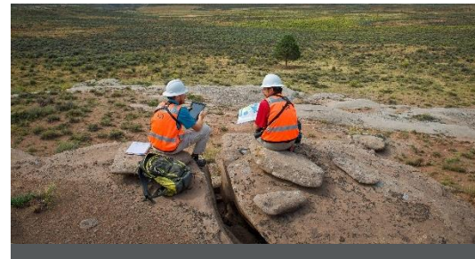
Environmental, Operations, and PM/CM