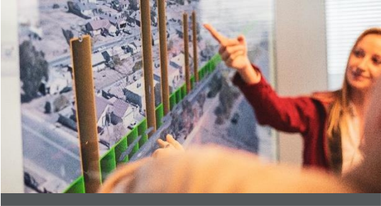
Planning, Asset Management, Facility Design