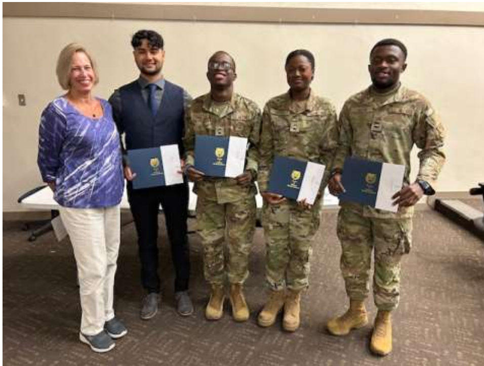
Texas Tech University Post Scholarship Winners